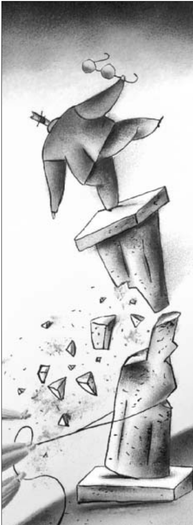
While celebrating a win is fine, declaring the war won can be catastrophic.

When it becomes clear to people that major change will take a long time, urgency levels can drop. Commitments to produce short-term wins help keep the urgency level up and force detailed analytical thinking that can clarify or revise visions.