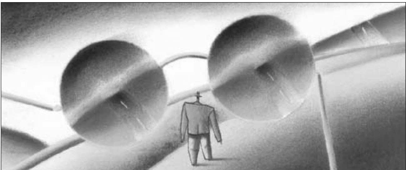
In failed transformations, you often find plenty of plans and programs, but no vision.

Companies that fail in phase two usually underestimate the difficulties of producing change and thus the importance of a powerful guiding coalition. Sometimes they have no history of teamwork at the top and therefore undervalue the importance of this type of coalition. Sometimes they expect the team to be led by a staff executive from human resources, quality, or strategic planning instead of a key line manager. No matter how capable or dedicated the staff head, groups without strong line leadership never achieve the power that is required.